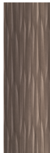
SSF-5531 SCALE WALNUT