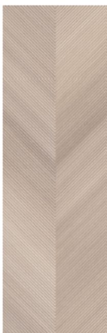
SSF-5532 CHEVRON MAPLE