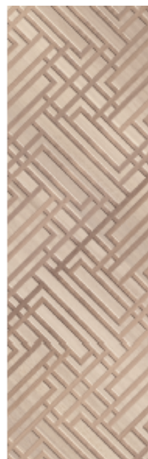
SSF-5534 MID MOD MAPLE