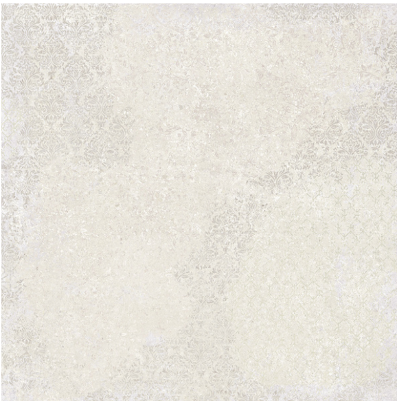
SSF-5080 BOHEMIAN IVORY NATURAL