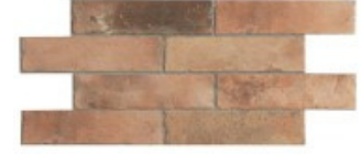
SSN-1516 East-North Matte