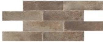
SSN-1515 West Matte