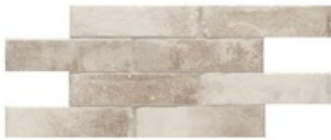
SSN-1514 Downtown Matte