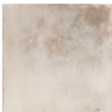
SSF-5897 Downtown Matte