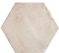
SSF-5894 Downtown Matte