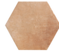
SSF-5895 East Matte