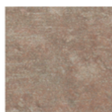
SSF-5899 West Matte