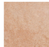
SSF-5898 East Matte