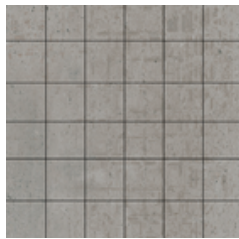
SSF-5031 BUILD GRAY NATURAL 2X2 MOSAIC