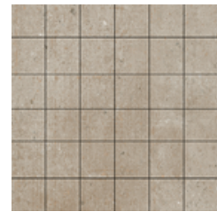
SSF-5032 BUILD GRAPHITE NATURAL 2X2 MOSAIC