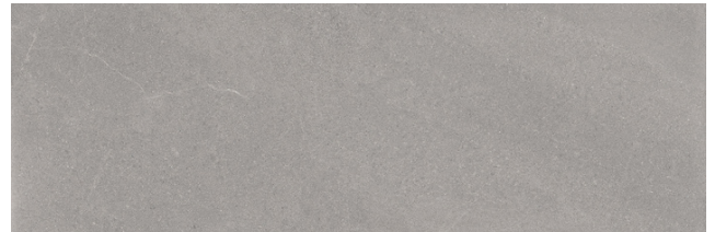
SSN-1922 Gray Matte