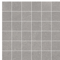
SSP-023 Gray Matte Mosaic