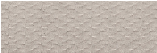
SSN-1923 Eden Pearl Matte