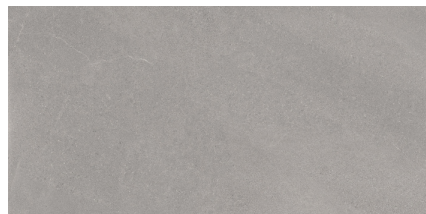
SSF-5921 | 12 X 24 SSF-5922 | 24 X 48 Gray Matte