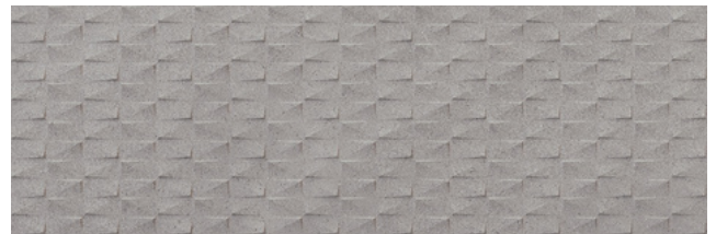
SSN-1924 Eden Gray Matte