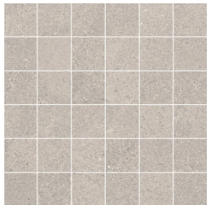
SSP-013 Pearl Matte Mosaic