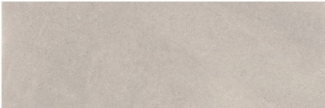
SSN-1921 Pearl Matte