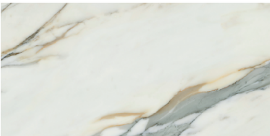
SSF-5620 | Polished SSF-5622 | Matte