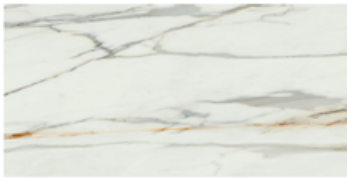
SSF-5619 | Polished SSF-5621 | Matte