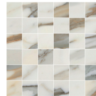
SSP-024 | Polished 2x2 Mosaic SSP-025 | Matte 2x2 Mosaic *Available upon request.