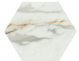
SSF-5627 Matte Hexagon