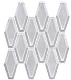
SSE-861 White Crackle Glossy