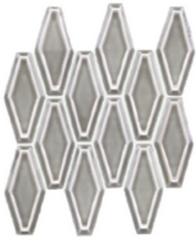
SSE-859 Dove Gray Crackle Glossy