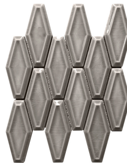
SSE-863 Cappuccino Crackle Glossy