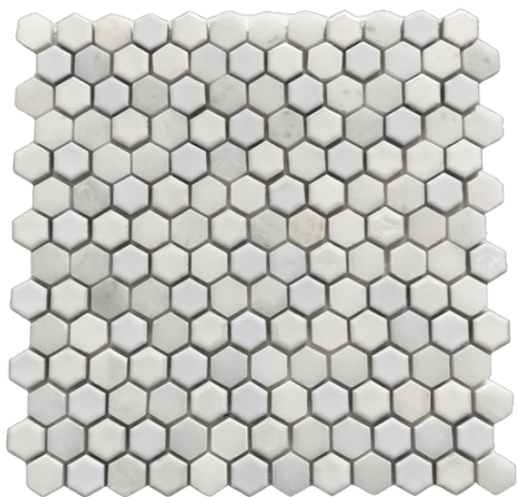
SSY-523 Seabrook Glossy