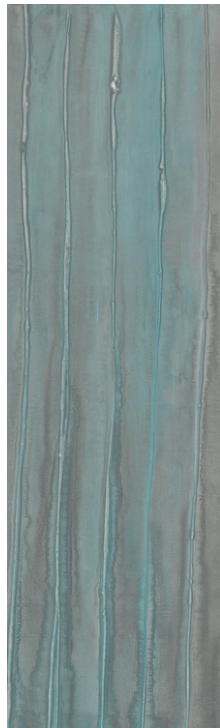
SSF-5078 Studio Matte