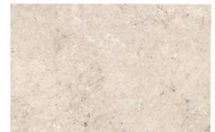
SSF-5906 Beige Matte