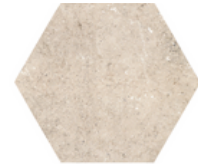
SSF-5912 Hexagon Beige Matte