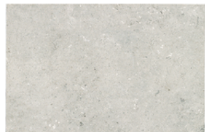
SSF-5905 Gris Matte