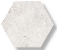
SSF-5910 Hexagon White Matte