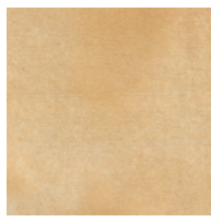
SSN-1667 Cotto Matte