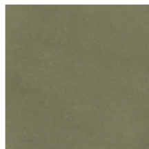
SSN-1669 Kale Matte