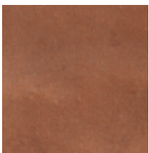
SSN-1668 Marsala Matte