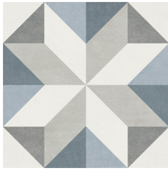
SSN-1644 FIORELLA GINA