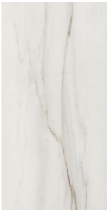
SSF-5799 Natural Matte