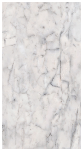
SSF-5602 Luce Matte