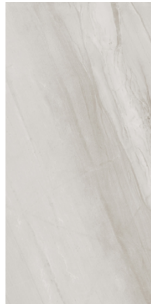
SSF-5701 SANDSTONE GRIS POLISHED