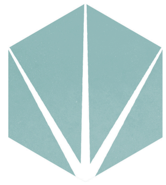
SSF-5208 STARLINE HEXAGON AQUA