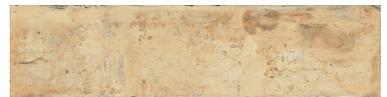
SSF-5015 Sand Natural