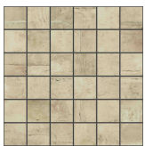
SSP-016 Mosaic Ice Natural