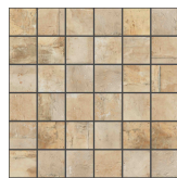
SSP-015 Mosaic Sand Natural