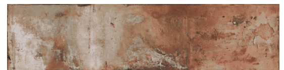
SSF-5016 Rosso Natural