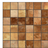
SSP-017 Mosaic Rosso Natural