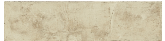
SSF-5014 Ice Natural