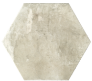
SSF-5043 Ice Hexagon