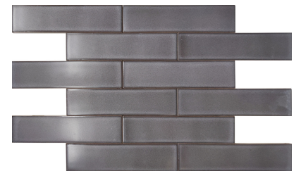
SSE-876 Shadow Matte