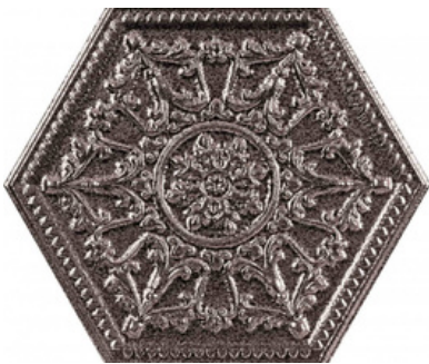
SSF-5853 Silver Mix Decor Hexagon Glossy