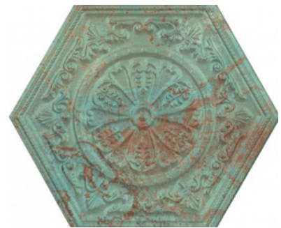
SSF-5855 Green Mix Decor Hexagon Matte